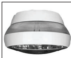
METAL HALIDE (MH)